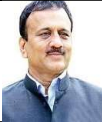
Pro-Chancellor Minister of Medical Education SHRI. GIRISH MAHAJAN